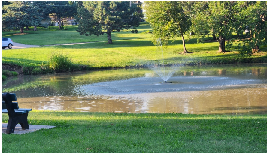
After some time, the pump in the upper pond is operating as is the lower pond.